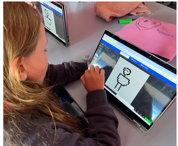
Primary school students developing coding skills integrated into literacy lessons as part of the Lithgow STEAM uplift pilot program.