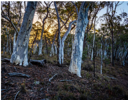
Far right: Capertee Valley