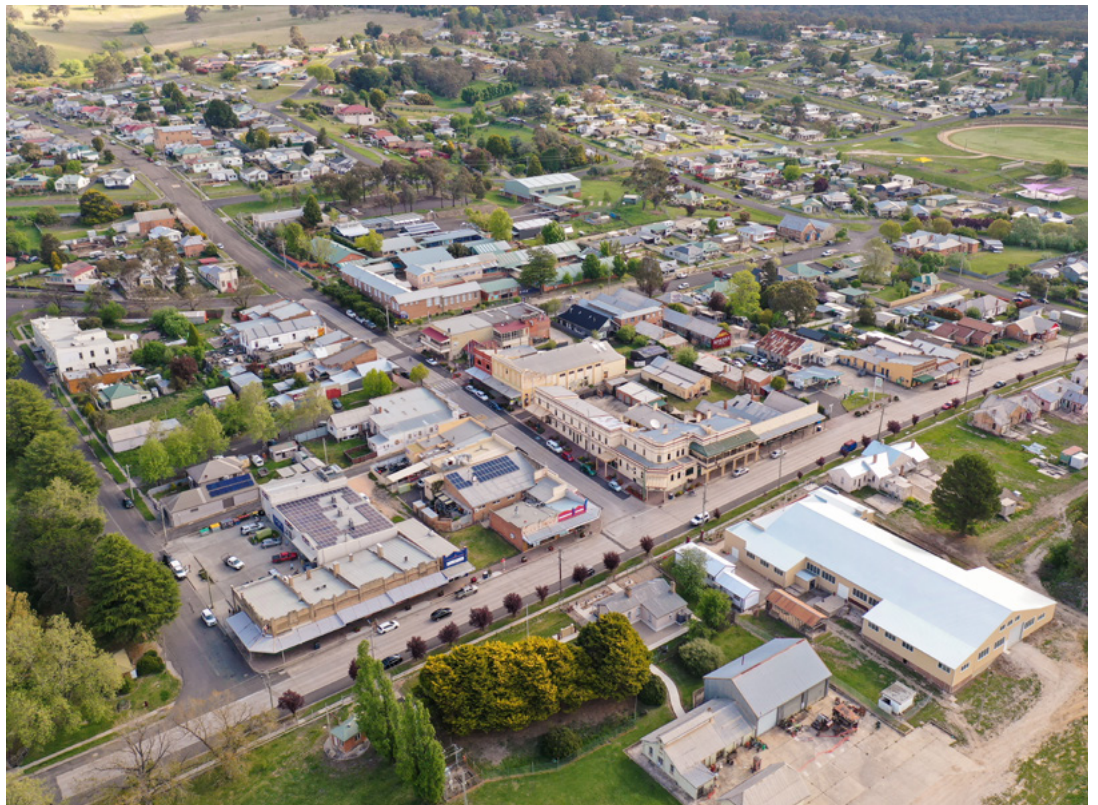
Right: The Main Street of Portland

Lithgow LGA is in a pivotal location in Australia's energy and transport system, the link between the fast-growing Western Sydney to our east and the broad Central West and Orana to the west. We are well positioned to take advantage of regional economic opportunities such as the new airport in Western Sydney, inland rail and the Central-West Orana Renewable Energy Zone. The area's rich natural, historical and cultural heritage, including seven National Parks and more than 400 declared Aboriginal sites, also provide opportunities for growth in tourism.