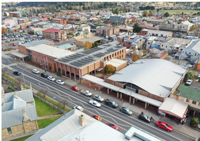
Above: Lithgow City Council