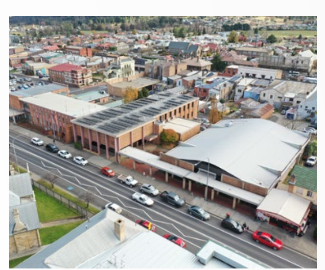
Lithgow City Council

Public administration and safety is the third largest sector in Lithgow, contributing $110.4 million or 7.8% to GVA, significantly higher than for NSW and Regional NSW.